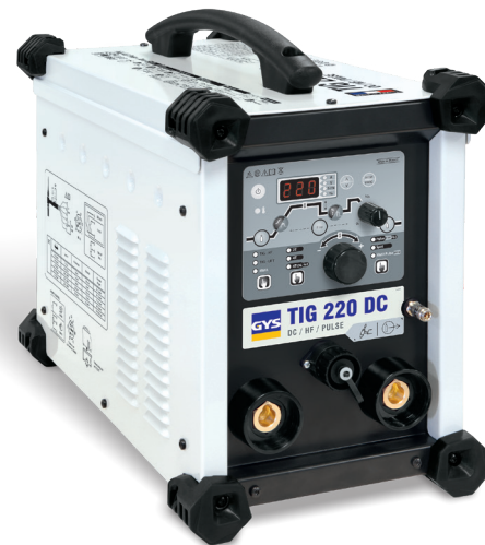
Supplied without accessories