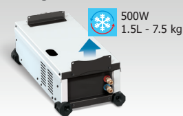
WCU 0.5kW A 039490