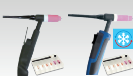
SR26 L 046184