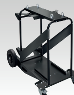
Trolley 10m 3 039711